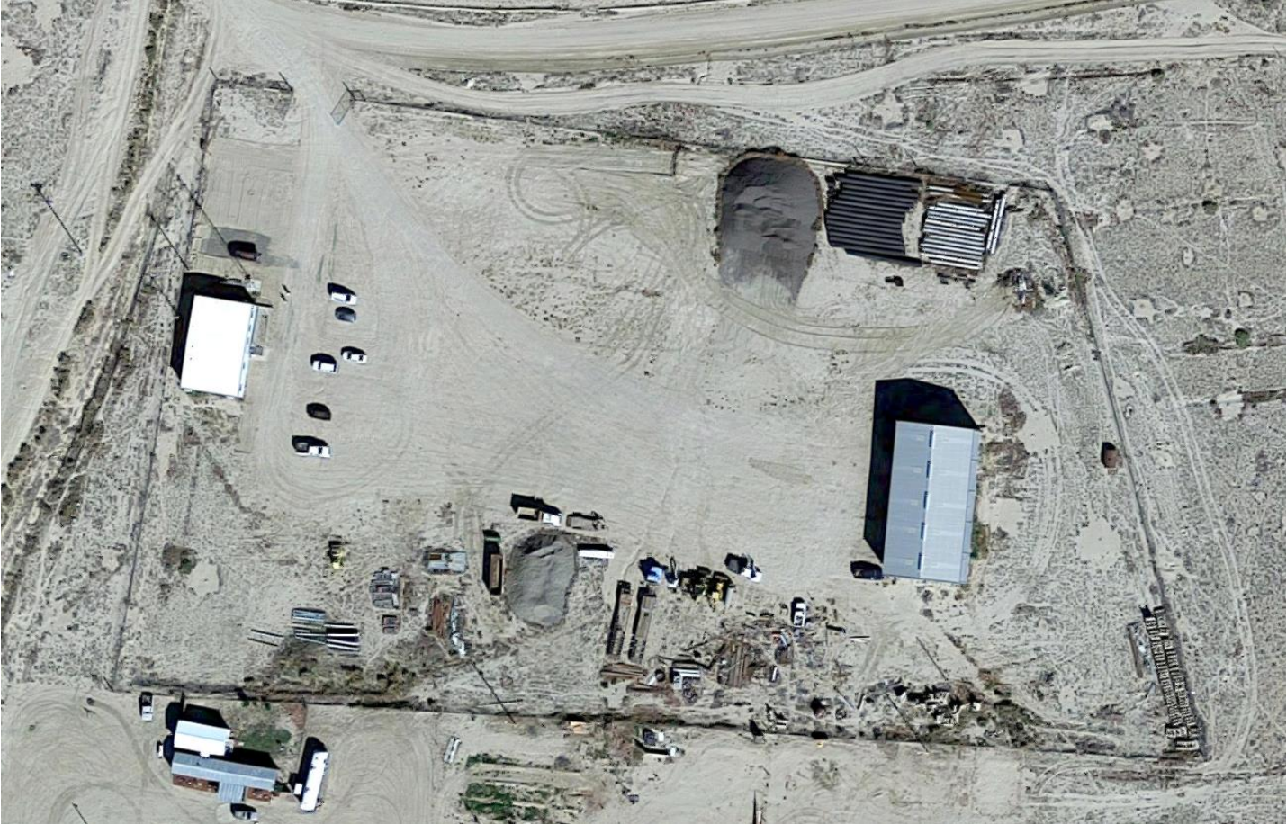
Project Area – Shiprock Irrigation Yard